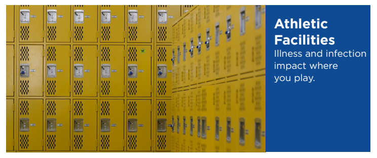
3. Source: http://www.hcup-us.ahrq.gov/reports/statbriefs/sb35.jsp

The direct cost of hospitalization alone due to a MRSA infection<sup>3</sup>