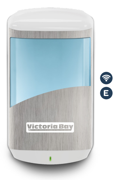
Victoria Bay ENERGY-ON-THE-REFILL AND COMMUNICATION CAPABLE

Durable and reliable push-style systems. Easy to maintain.