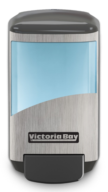
Victoria Bay MANUAL

Two new systems that are built for reliability and high performance. Both dispensing options are available in the color options shown below.