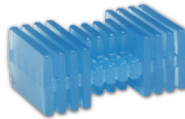
348254 AUTOMATED IN-STALL FRESHENER DISPENSER REFILL COASTAL BREEZE • 12/CASE

Anti-theft: Key and lock provides ample security to help reduce the risk of vandalism or theft.