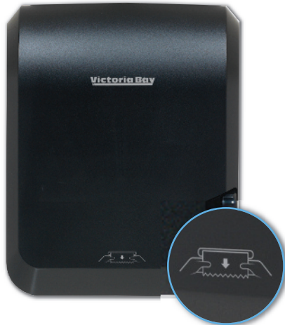
346356 VICTORIA BAY MECHANICAL PAPER ROLL TOWEL DISPENSER 12.9"x9"x16"