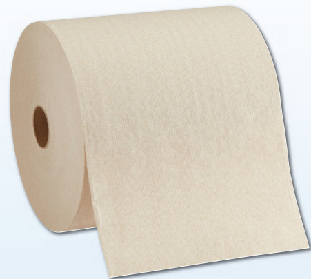
346359 VICTORIA BAY 8" RECYCLED PAPER TOWEL ROLL BROWN • 1150 FT/ROLL • 6 ROLLS/CASE