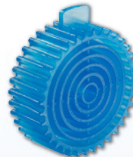
348253 POWERED WHOLE-ROOM FRESHENER DISPENSER REFILL COASTAL BREEZE • 12/CASE

Easy to Maintain: Simple installation and easy access design makes maintenance a breeze.