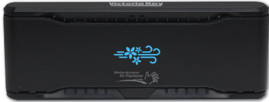
347050 VICTORIA BAY AUTOMATED IN-STALL FRESHENER DISPENSER 1.2"x9.6"x3.5"