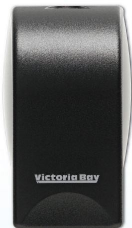
348252 VICTORIA BAY POWERED WHOLE-ROOM FRESHENER DISPENSER 4.1"x3.6"x6.8"

VOC Compliant: Compliant for VOC content with applicable federal and state regulations.