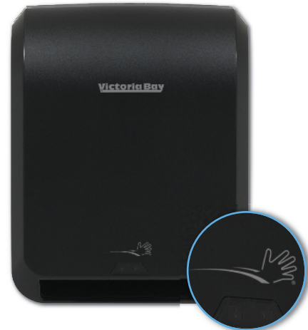
346357 VICTORIA BAY AUTOMATED PAPER ROLL TOWEL DISPENSER 12.9"x9"x16"

Easy to Maintain: High-capacity 1150-ft towel rolls last longer, requiring less maintenance and minimizing refill frequency.