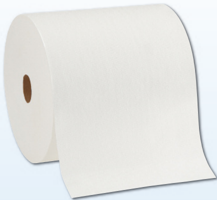
346358 VICTORIA BAY 8" RECYCLED PAPER TOWEL ROLL WHITE • 1150 FT/ROLL • 6 ROLLS/CASE

Affordable Quality: The high-quality choice with one-at-a-time towel dispensing to help prevent waste.